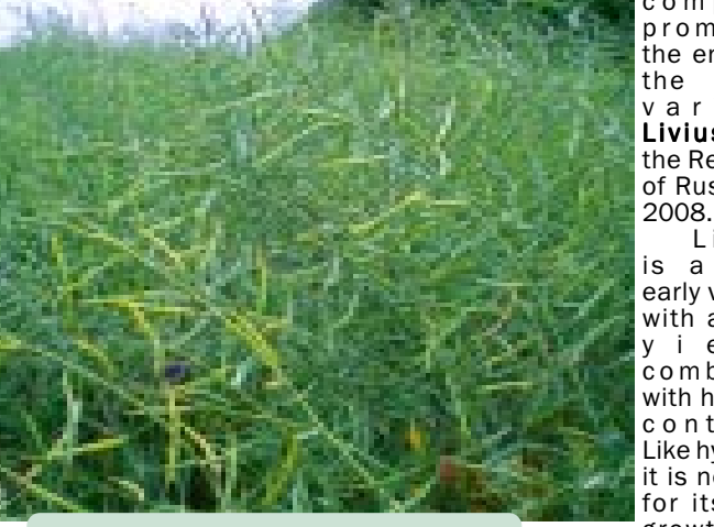
Winter rapeseed on the fields of EkoNiva-Agro in the Voronezh region continues to hold a place of honour.

Samurai amazed all of the therefore is very resistant to Field Day visitors with its short falling and bursting.