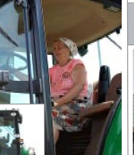
I never would have asked my neighbour to plough my garden here,

5. My Native Village and My Home (Send us photos featuring the most interesting moments in the life of your native village)