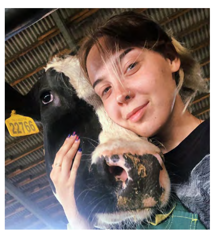
voung technical school and one

veterinarian of the most talented trainees is top of the class at the of EkoNiva. She did her internship at Kolybelka dairy