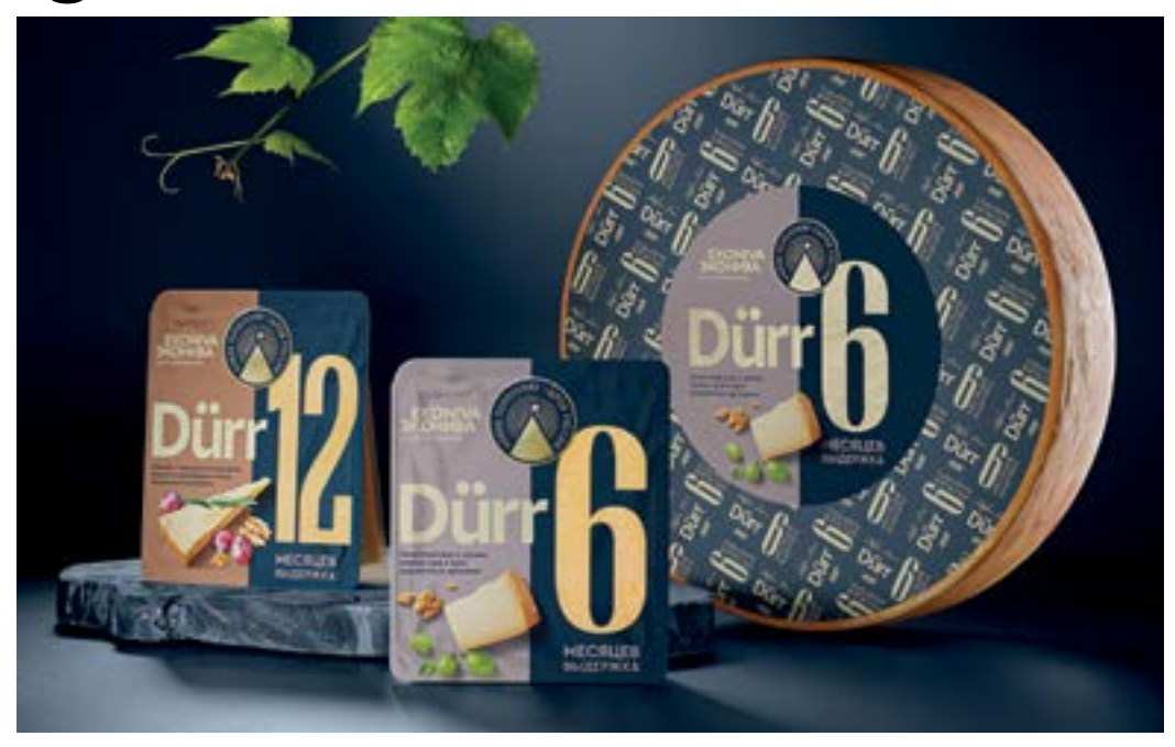
The 6-month Premium Dürr cheese named after the founder of the Group – Stefan Dürr – has hit the shop shelves.

Dürr cheese is aged for 6 or 12 months. The 6-month cheese is already offered for sale in Perekrestok and Globus hypermarket chains, which were the first to sign contracts with EkoNiva. So far, Dürr is sold by weight at supermarket