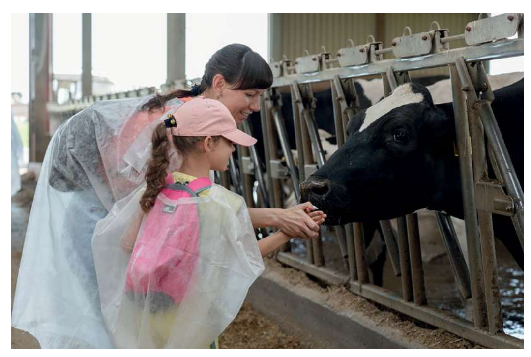
Over 100,000 guests have visited EkoNiva farms in Voronezh and Kaluga oblasts since 2013.

koNiva was the first agricultural company to open its doors to tourists, which made it a pioneer of industrial tourism in Russia.