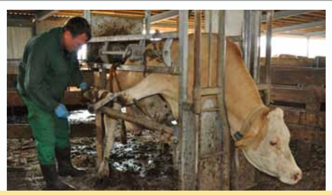
Toe nail care is OK. Time for milking now! Where are my smart boyfriends, tell me, dear cow! At the OOO Zashchitnoye Company's cattle breeding facility