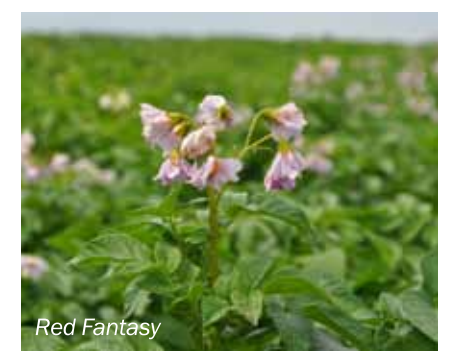
By Anna BORDUNOVA

"Last year we purchased 20 tonnes of Red Fantasy potato seeds from EkoNiva. We liked the seed quality. We sowed 6 hectares. The sowing density was 20 to 25 cm between the ridges. We used combined plant protection products, such as various types of herbicides, phytophthora compounds and others. The potatoes were sowed in drought. Precipitation occurred only during blossoming. The variety tillers well, the stalks grow strong and the tubers are of medium size. The yield was 40 tonnes per hectare. The only problem was the small number of tubers, up to 6 on average. However, colleagues who grow the Red Fantasy variety had a higher tuber yield. For the new season, we shall test the Bellarosa and Collette varieties."