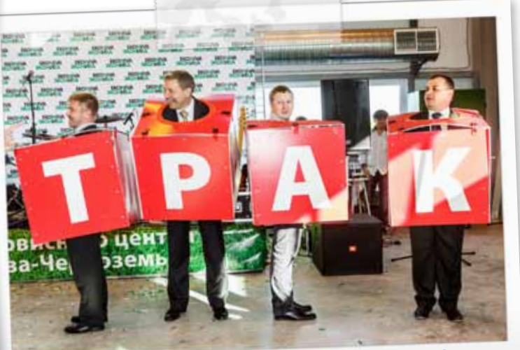
He who turns faster will get the word right! Smart games at the opening of the servicing centre at EkoNiva-Chernozemye

EkoNiva-News continues to publish the best snapshots under the FOCUS ON US! project. We urge participation on everyone who believes that interesting moments showing country life and people working the land are worth preserving for posterity.