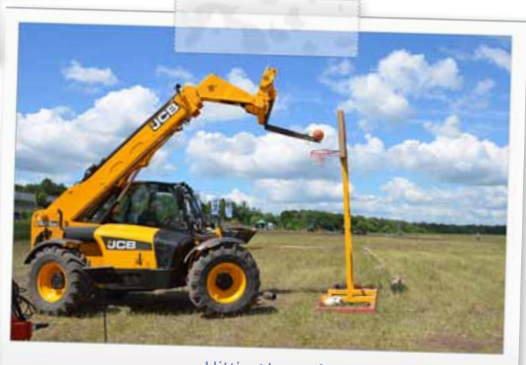
Hitting home! Playing basketball on the JCB loader is such fun!

Please, send you photos marked FOCUS ON US! to: